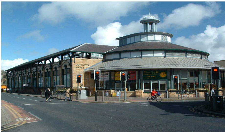
← Lancaster Market

Following on from officer responses on these issues the Committee agreed to request a briefing note and officer attendance at a later meeting with regard to Lancaster Market.