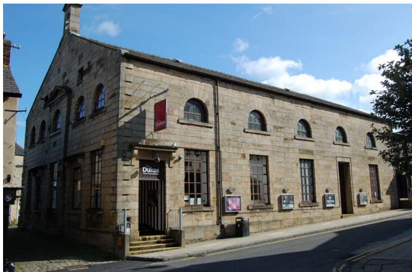
←The Duke's Theatre –

An indication of the briefing notes requested by the Panel this year is provided on page 23.